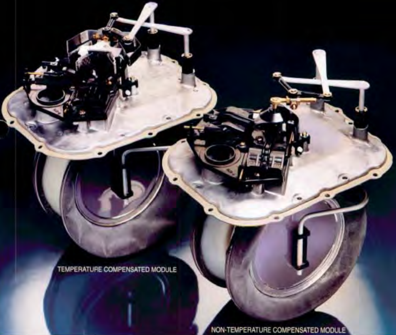
TEMPERATURE COMPENSATED MODULE