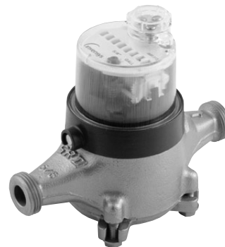
5/8" SR II-EB AMR (pictured) 3/4" and 1" available

A drive magnet transmits the motion of the piston to a driven magnet located within the hermetically sealed register. The driven magnet is connected to the register gear train. It reduces the piston oscillations into volume totalization units displayed on the register dial face.