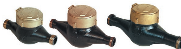
5/8" PMX-EC ® (DN 15mm)