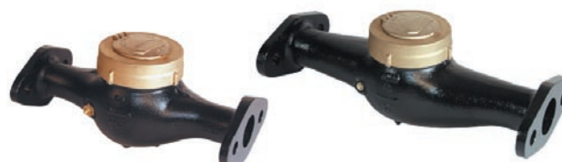
1-1/2" PMX-EC® (DN 40mm)